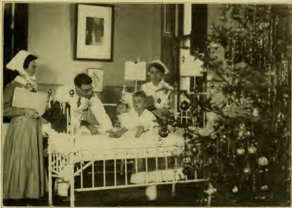
Nursing brings many contacts with patients, doctors, nurses.